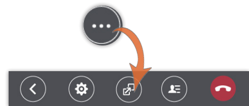
Screen sharing control