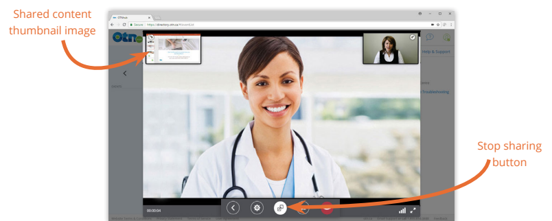
Chrome with shared content