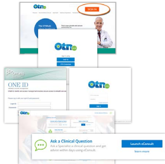
Figure 1: OTNhub sign in screens and home page

After you have logged in to eConsult, for additional information see eConsult Features and Overview .